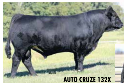
AUTO CRUZE 132X