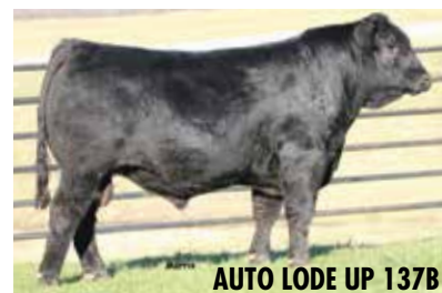
AUTO LODE UP 137B