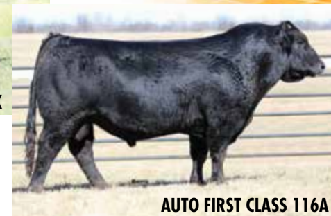
AUTO FIRST CLASS 116A