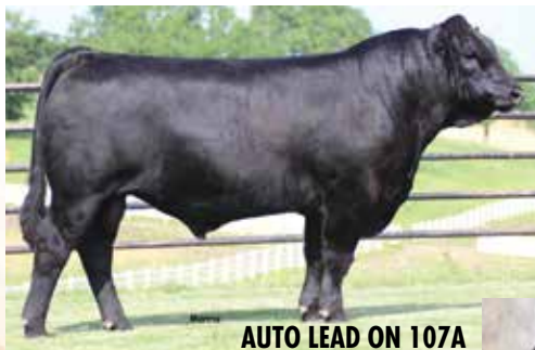
AUTO LEAD ON 107A