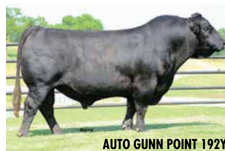
AUTO GUNN POINT 192Y