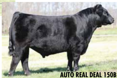
AUTO REAL DEAL 150B