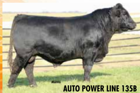
AUTO POWER LINE 135B